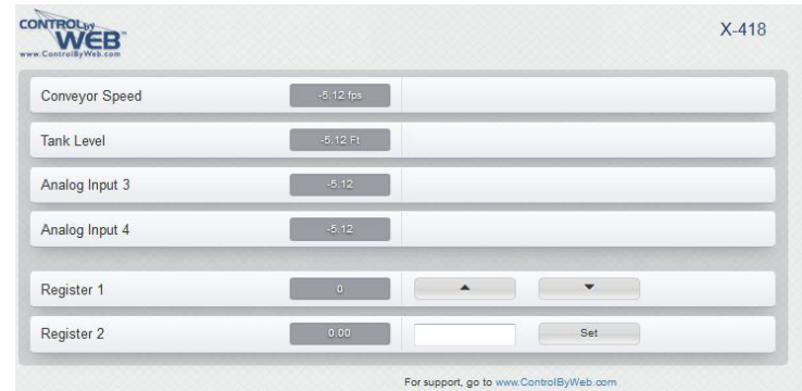
Example X-418 Control Page